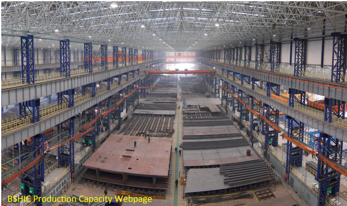
BSHIC Production Capacity Webpage