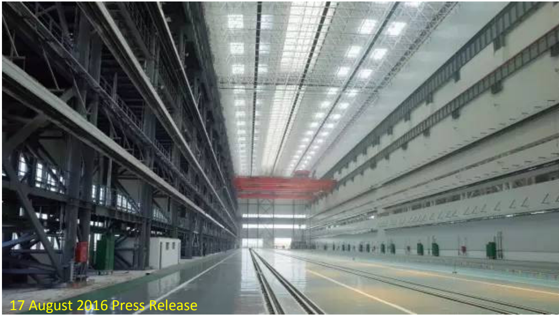
17 August 2016 Press Release