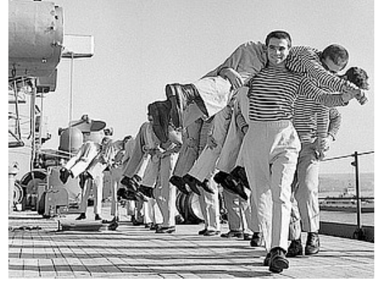
Russia's Black Sea Fleet marines carry out acrobatic exercise called "transportation of heavy-weight items" or "transportation of a wounded person" on board of "Mikhail Kutuzov" cruiser, February 19, 2008.